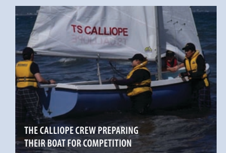
THE CALLIOPE CREW PREPARING THEIR BOAT FOR COMPETITION