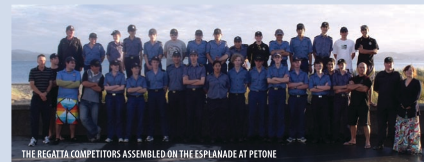
THE REGATTA COMPETITORS ASSEMBLED ON THE ESPLANADE AT PETONE