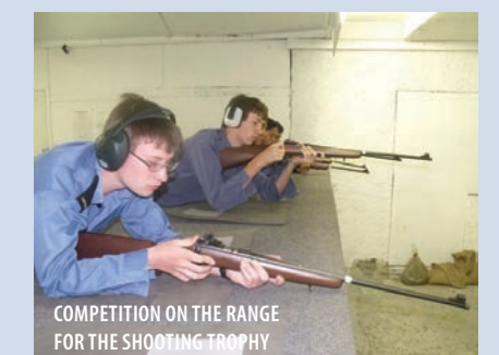
COMPETITION ON THE RANGE FOR THE SHOOTING TROPHY

The Regatta was held this year at TS TAMATOA in Petone; the five Central Area units came together to compete in seamanship, sailing, pulling and land-based activities such as Drill, First Aid and Shooting. For some of the teams it was their first time at a Regatta and also their first time on a military base, at Trentham Army Camp. With TS TAMATOA and TS TUTIRA teamed up together, the four teams competed for the nine trophies including Best Individual Shot, Endeavor, and of course, Top Overall Unit. The whole team from Calliope put in a huge effort and I was proud to be their team leader for the weekend. I would like to say 'Thank you' to the staff who organized the Regatta—they do so much that we don't see.